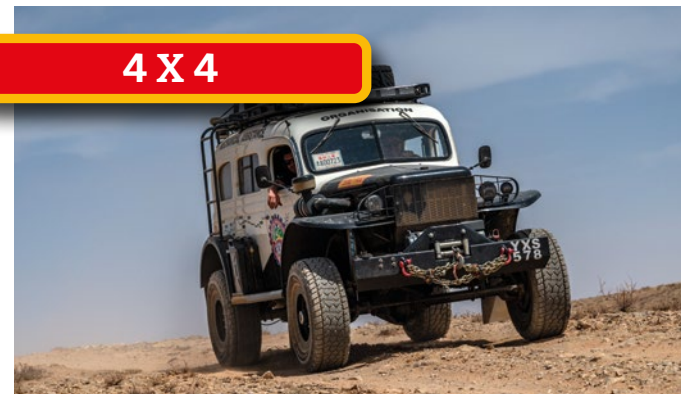
4 X 4